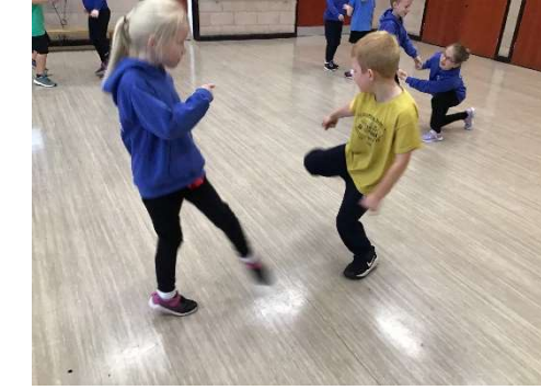
For your information

PE - will take place on Tuesday mornings and Wednesday afternoons. Please ensure your child is wearing a PE kit in school on these days - thank you.