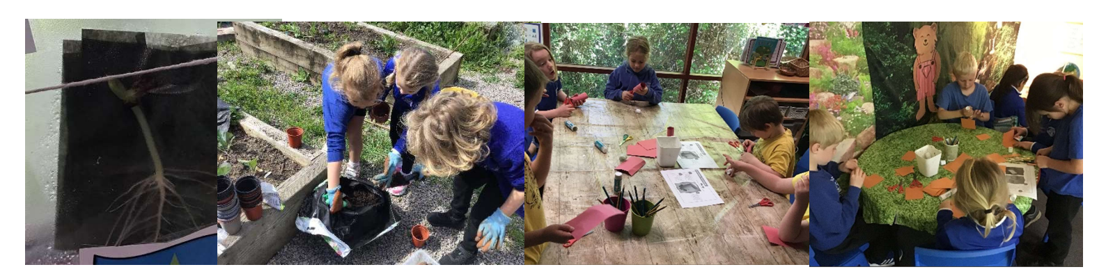
Science – planting our beans into pots; DT – trying different joining techniques

*To make our final piece chairs for baby bear we need your card recycling! In particular cardboard boxes (cereal box type thickness of cardboard preferrably) and card tubes. Please could any card come into class on or before Tuesday 20<sup>th</sup> May. No plastic recycling needed, thank you.