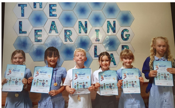
Some of the Year 4 children with their certificates.

Congratulations to all the children who took part in the South Glos Library Reading Challenge this summer. We are very impressed by the huge amount of children, who engaged with the programme. In celebration assembly, the children shared their certificates and medals.