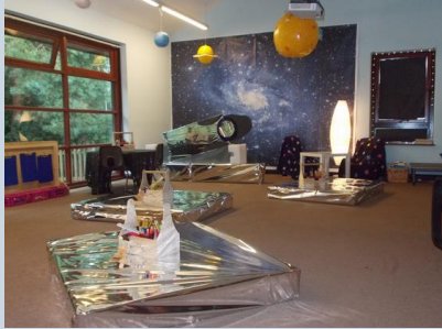
Some of the recent purchases using money raised by FOAHS