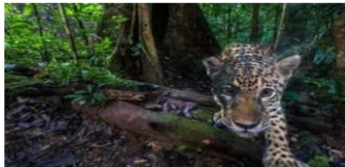
WHAT DOES IT TAKE TO SURVIVE ?

MUSIC – body percussion, rhythm and beats