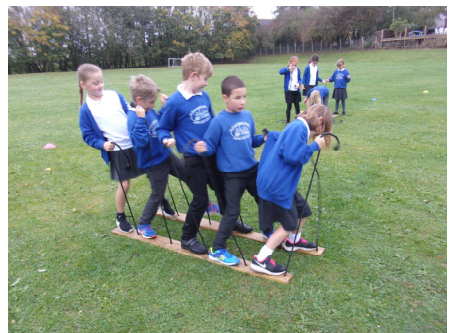
Collaborative skills, communication and a lot of perseverance!

This week we have been looking at organising words according to their word classes and the children have been looking at sentences and trying to find the nouns, verbs, adjectives and adverbs. Here is an example: