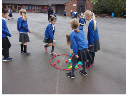
Working as a team to problem solve