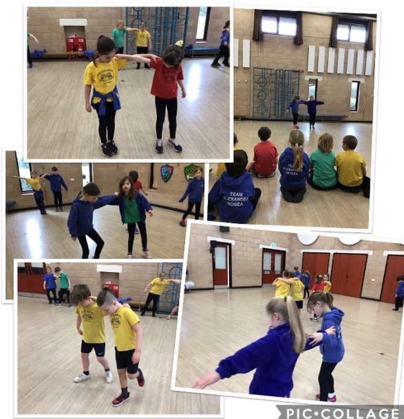
Greek dance in PE this week

Swimming is next week, please ensure the children have their swimming kit each day and for world book day make sure they can change in and out of their costume with ease and pack PE kit or a spare pair of clothes to change into after swimming.