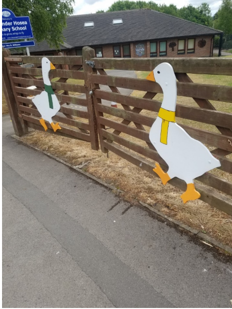
In at the goose gate

It is important that we all arrive on time and follow the one way system to come into school. You must arrive and leave at the time you are given.