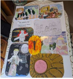
Severn Vale Art Trail

Last term, Year 6 had the opportunity to work with one of the organisers of the Art Trail and they produced art depicting the Easter Story. The children's work will be displayed in the church alongside the visiting artists on 2 nd to 6 th May. The Severn Vale Art Trail is an annual art trail in and around the Severn Vale see www.severnvalleartrail.org if you would like to visit any of the art exhibitions.