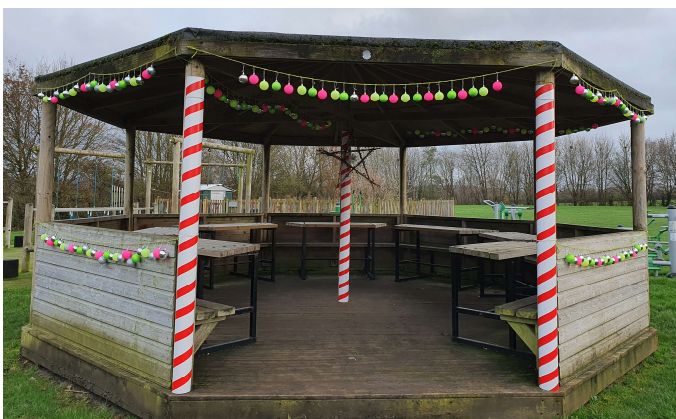
Thank you to the Friends of AHS for decorating the outdoor classroom for the class performances.

As you will be aware, South Gloucestershire left the recent lockdown in Tier 3 (the highest tier). There is clear guidance about what is required of residents in our county https://www.gov.uk/guidance/tier-3-very-high-alert . From a school point of view, very little has changed, we are still: cleaning regularly; promoting handwashing; socially distancing bubbles etc. We would strongly encourage parents to wear masks at drop off/collection times (see South Glos letter to parents in the county).