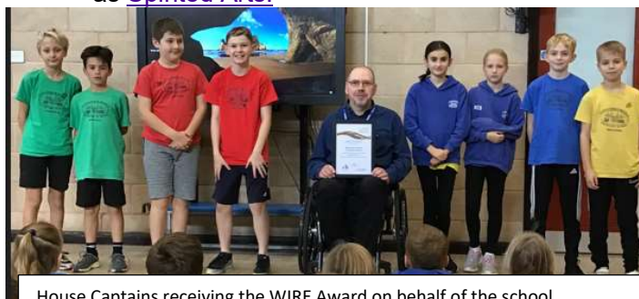
House Captains receiving the WIRE Award on behalf of the school