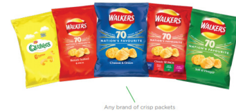
Any brand of crisp packets

Thank you for your used crisp packets, we will soon be able to post the first batch to Terracycle. Keep them coming!