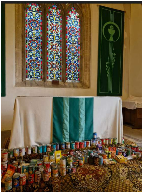
Harvest donations at Trinity Church this week