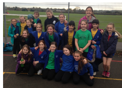
School Netball Team

A photograph of the netball team at a tournament this Wednesday. Amazing attitude from all children, great emerald and ruby powers!